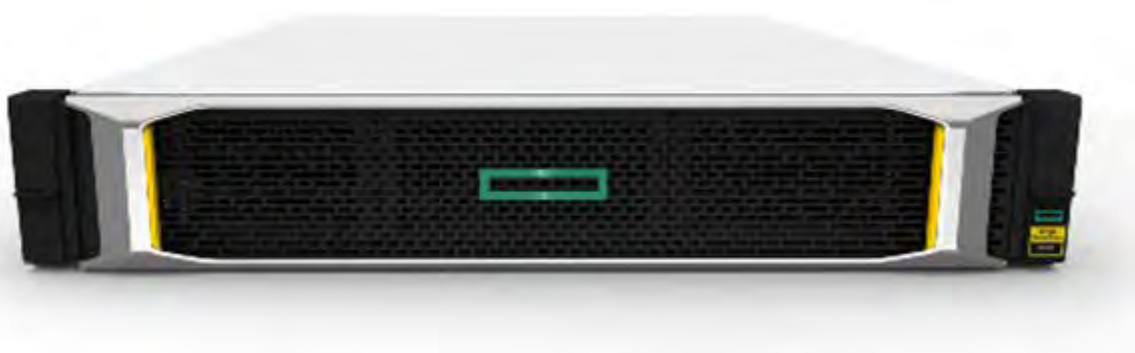
HPE MSA 2052 SAN Storage