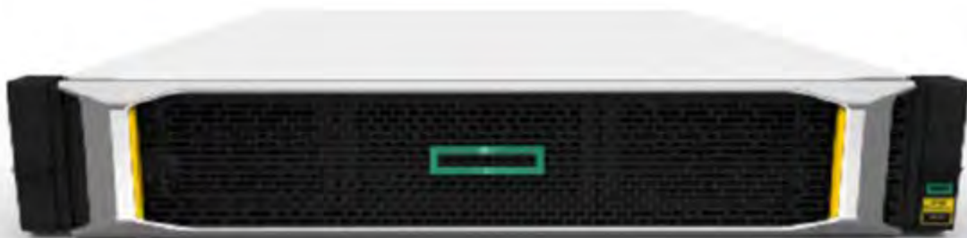
HPE MSA 2050 SAN Storage